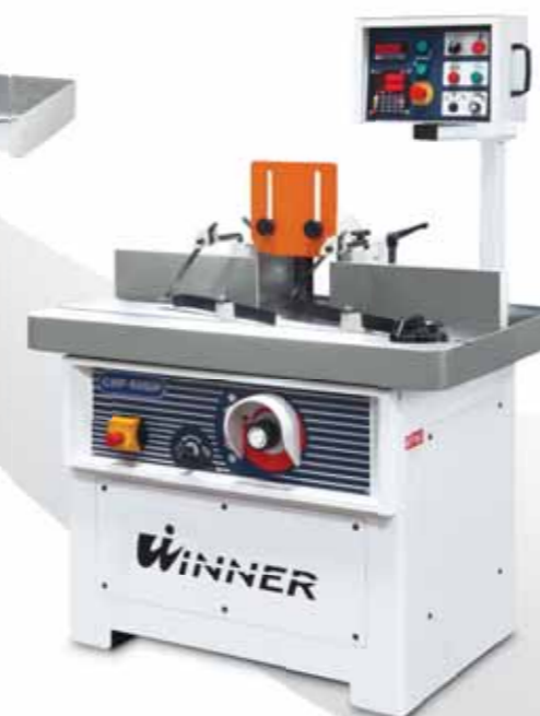
HIGH SPEED SHAPER